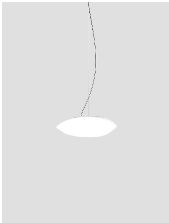
MODUL SP M BCST BO E27 CE